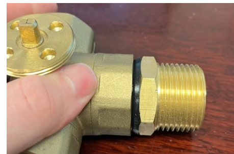
Torqued to spec