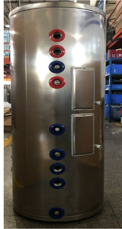
Buffer / Multi-Purpose All-Stainless Steel Tank 58 Gallons / 220 L

Dimensions: Millimeters unless otherwise noted